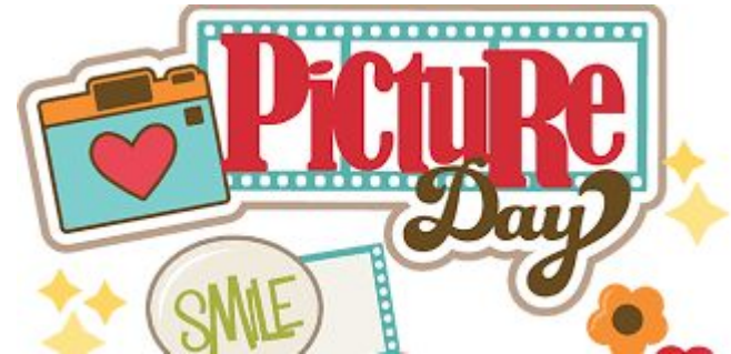
Photo retake day is Tuesday, September 27th.

If you missed today with your class, please go to the double gym during the first half of lunch to have your photo taken.